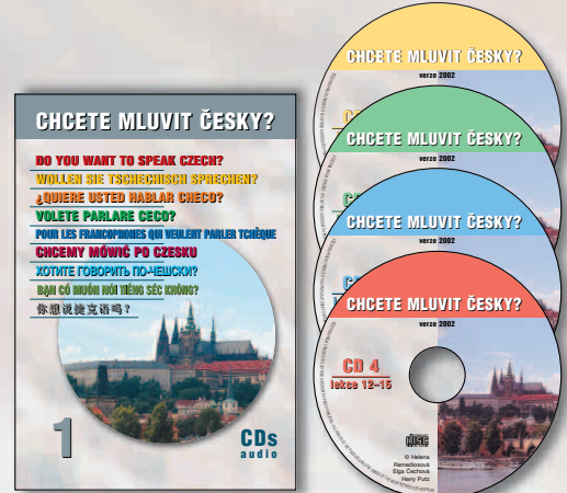
6th Edition – ISBN 978-80-86727-21-9